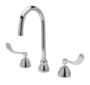
Z831B4-XL-3F Ultra low-flow outlet options No battery or electronics required ADA compliant manual faucet