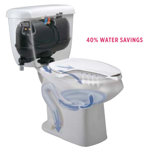
Water Conserving Flush 1.0 gallon [4 liters]