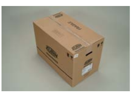
Final pack-out for water closet and brass trim accessories