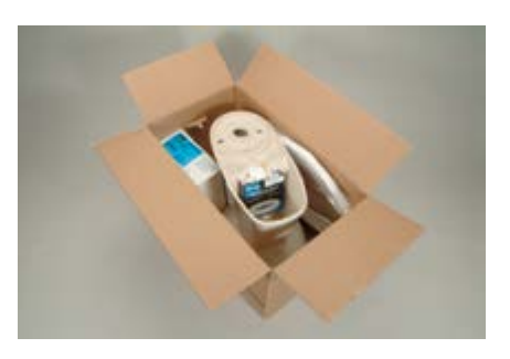
Trim accessories packaged within inner box to protect water closet fixture