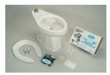
Water closet and accessories

Zurn One Systems combine Zurn flush valves and faucets with Zurn fixtures. These systems are packaged together and shipped in one box to the job site and can be tagged with any information required such as a specific floor, building, or wing. Receive ready-to-install plumbing solutions for easy organization, handling, and sorting.