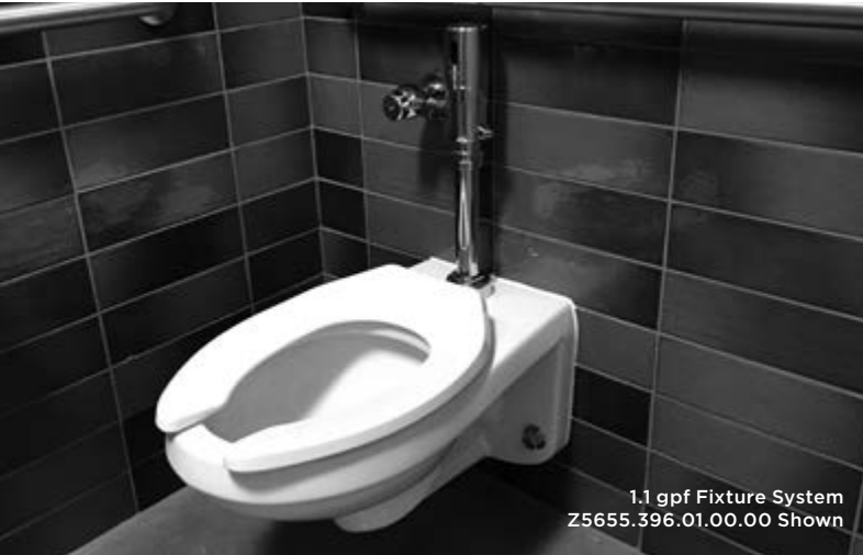
1.1 gpf Fixture System Z5655.396.01.00.00 Shown