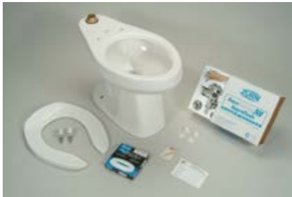
Water closet and accessories

Zurn One Systems combine Zurn flush valves and faucets with Zurn fixtures. These systems are packaged together and shipped in one box to the job site and can be tagged with any information required such as a specific floor, building, or wing. Receive ready-to-install plumbing solutions for easy organization, handling, and sorting.