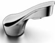
Z6951-XL Aqua-FIT Fulmer Series™ Sensor Faucet