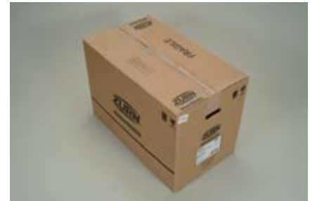
Final pack-out for water closet and brass trim accessories