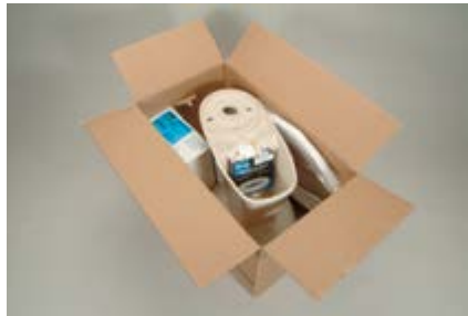
Trim accessories packaged within inner box to protect water closet fixture