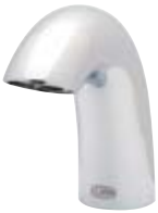
Z6950-XL-S-LL Aqua-FIT® Serio Series™ Sensor Faucet