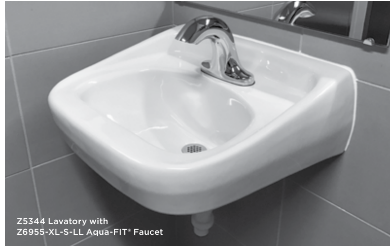
Z5344 Lavatory with Z6955-XL-S-LL Aqua-FIT® Faucet