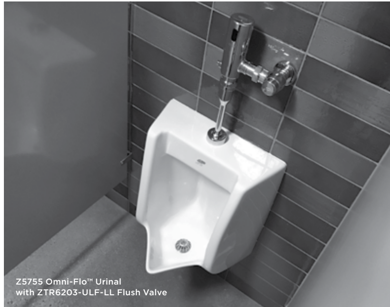
Z5755 Omni-Flo™ Urinal with ZTR6203-ULF-LL Flush Valve