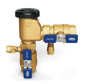
710 Pressure Vacuum Breaker