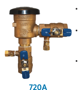
Pressure Vacuum Breaker