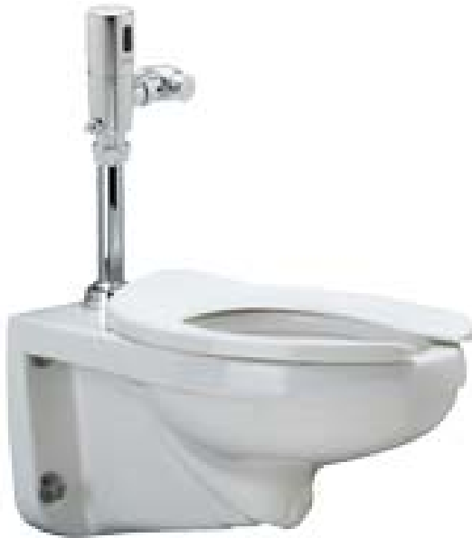
Z5615 Series Elongated (shown with seat)