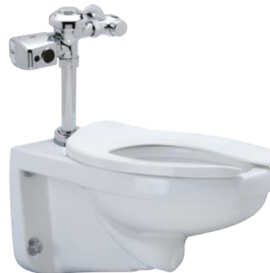
Z5615 Series Elongated (shown with seat)