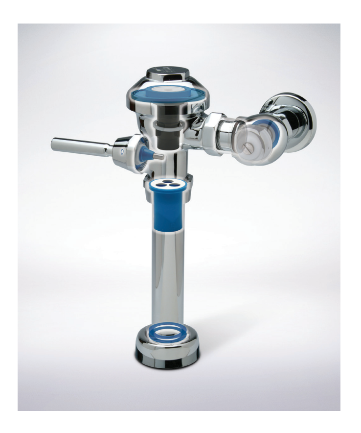
Zurn's AquaVantage AV flush valves have been proven to withstand prolonged exposure to the same chemicals that cut short the life of other diaphragm kits.

In addition to the industry-leading performance of Zurn's AquaVantage flush valves, Zurn's valves an engineered brass alloy with Antimony as a dezincification inhibitor. The end result is an alloy that performs very well in accelerated dezincification tests such as AS2345 and which can hold up against the hardest water.